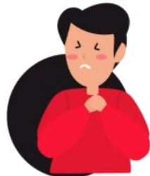
Out of breath